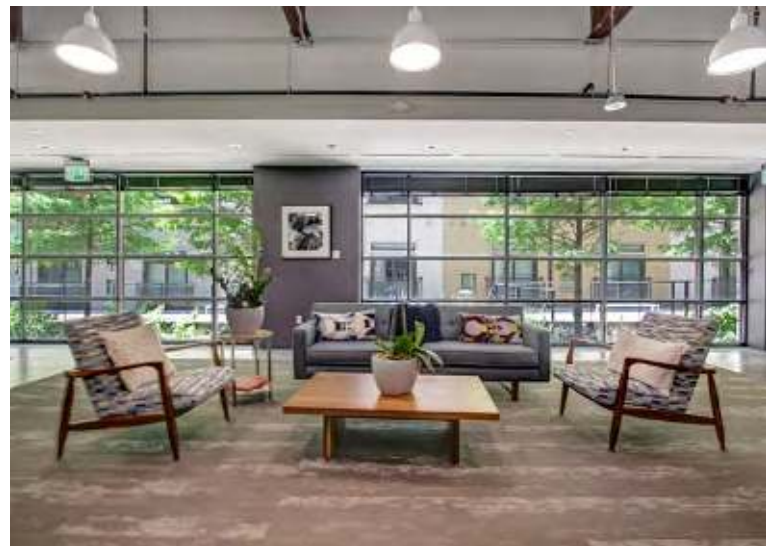
Top, left, right: Open office space, collaboration area, collaboration area alternate view