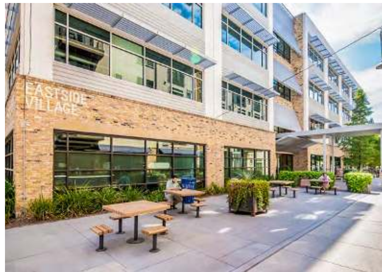
Top, left, right: Kitchen, conference room, building exterior with outdoor seating areas