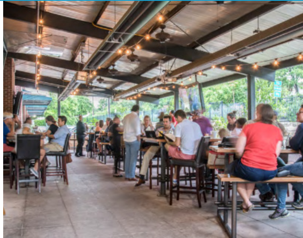
Left, right: Restaurant exterior, restaurant patio