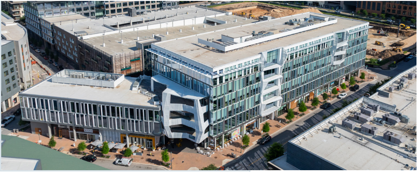
● — Alpha

Alpha Building, the first multi-tenant office opportunity within Mueller Business District, offers the entire second floor and portion of third floor for lease. Tenant's will enjoy a state of the art new building experience with best in class amenities in a walkable setting proximate to a beautiful courtyard area, numerous restaurants/retail, and the Origin Hotel.