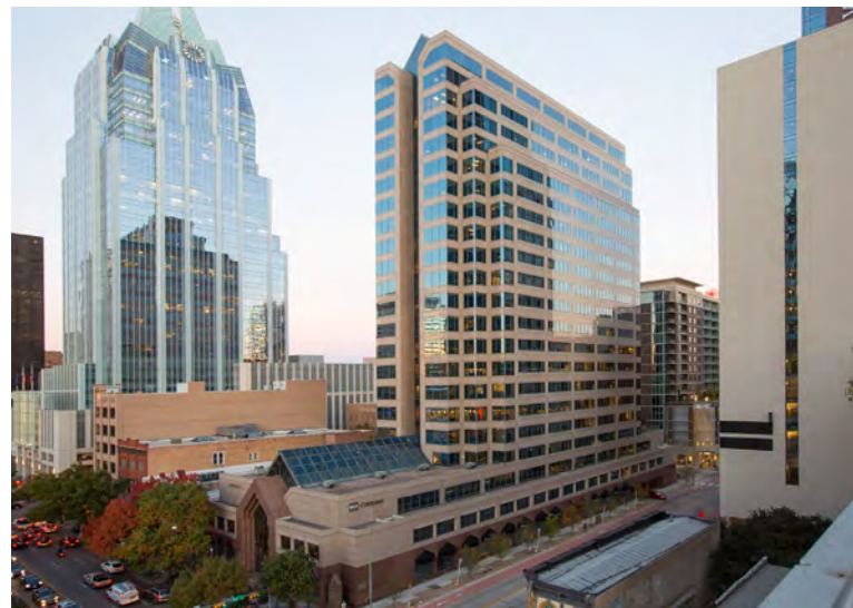
Top, left, right: Fitness center, building entrance, building exterior