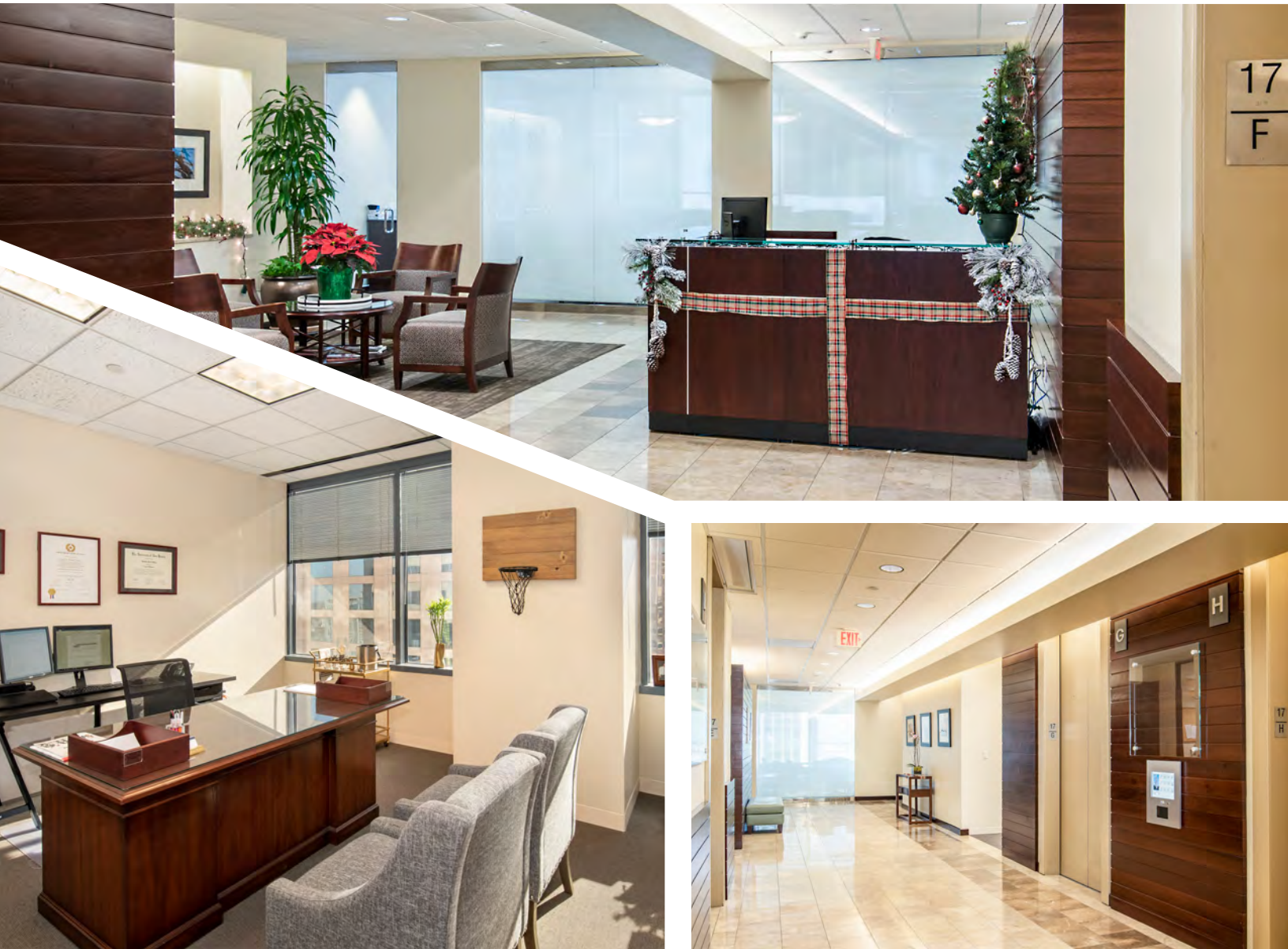
Top, left, right: Reception/lobby area, private office, elevator corridor

301 CONGRESS AVENUE • AUSTIN, TEXAS 78701