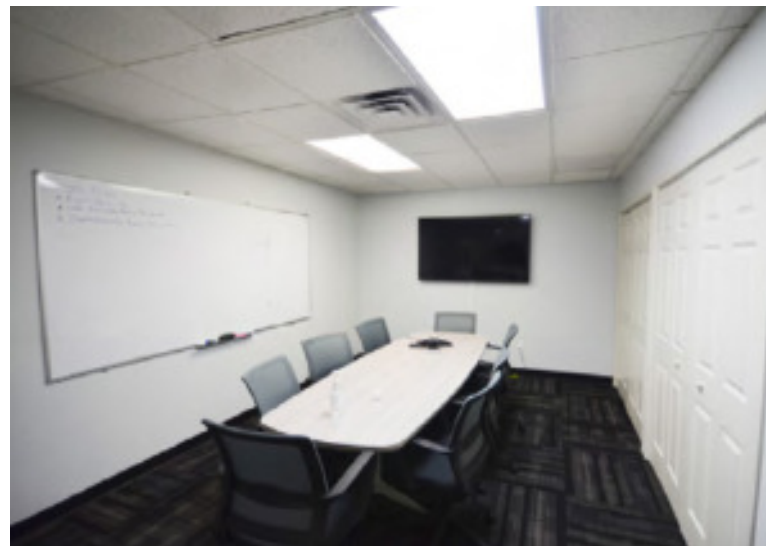
Top, left, right: Break area and open office, private entrance, conference room