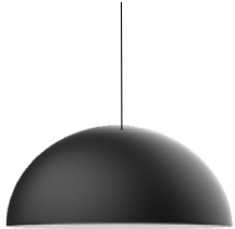
RECEPTION, BREAK ROOM & WALKWAYS