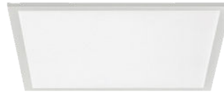
OFFICES, PHONE ROOMS & HUDDLES