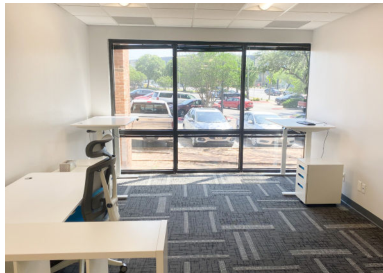
Top, left, right: Open office, kitchenette, shared office