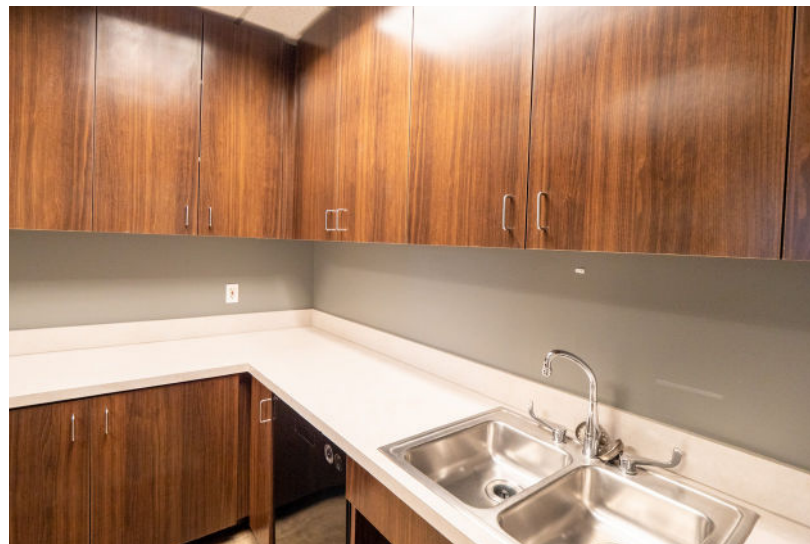
Top, left, right: Open office space, mail room, and kitchen/break room