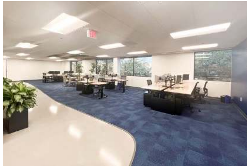
Top, left, right: Kitchen/break room, conference room, and open work-space