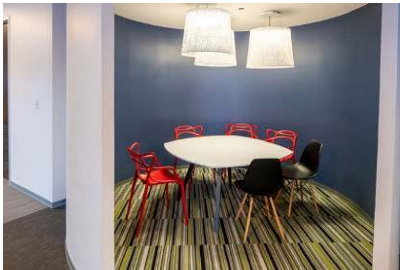
Top, left, right: Kitchen/break room, break/meet space, secluded dining area