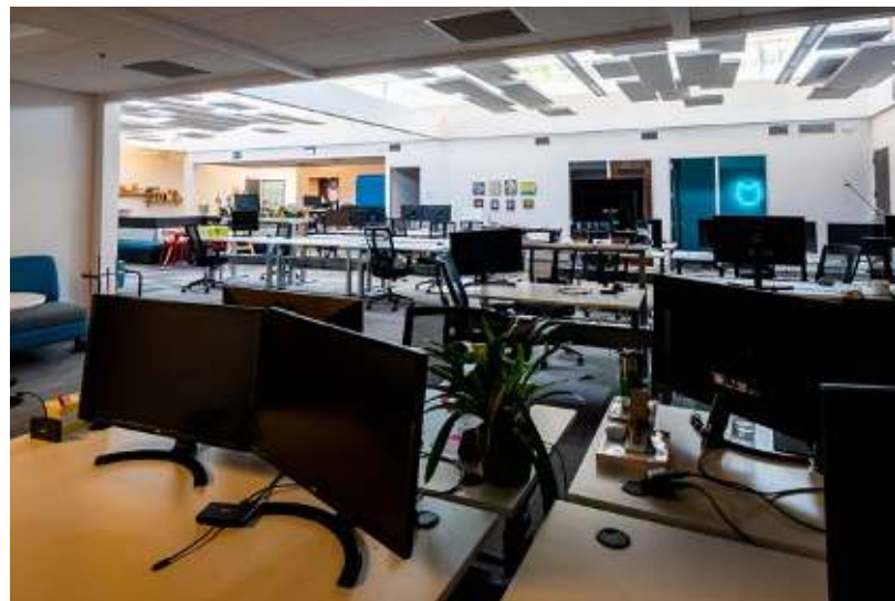
Top, left, right: Conference room, open workspace (with phonebooths), open workspace