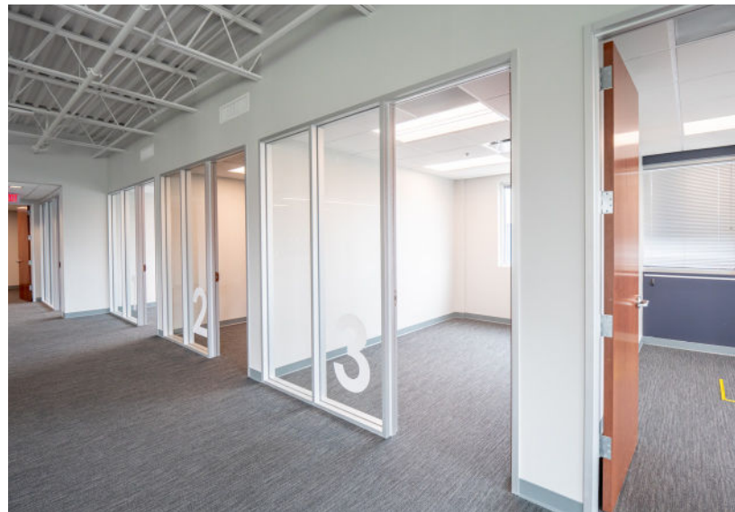
Top, left, right: Open space, kitchen, private offices