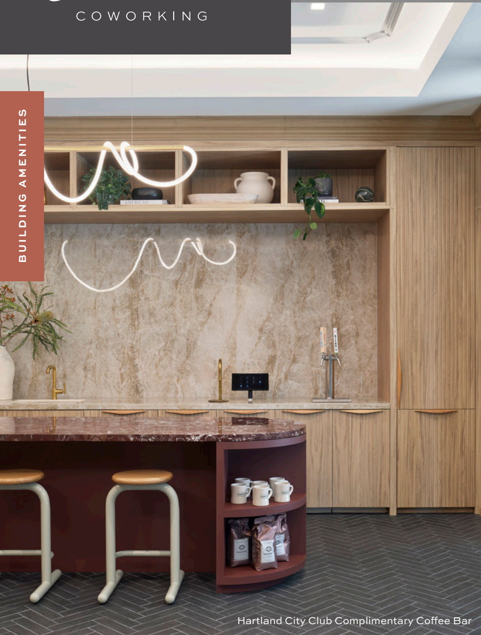
Hartland City Club Complimentary Coffee Bar