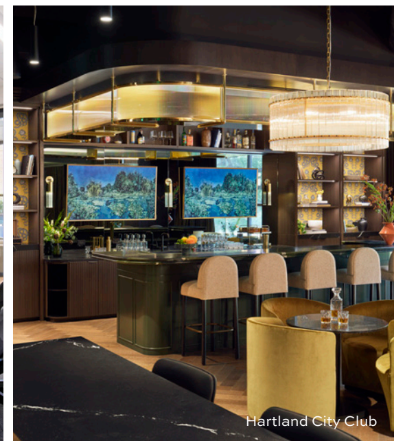
Hartland City Club

FOR LEASING & MORE INFORMATION, CONTACT: