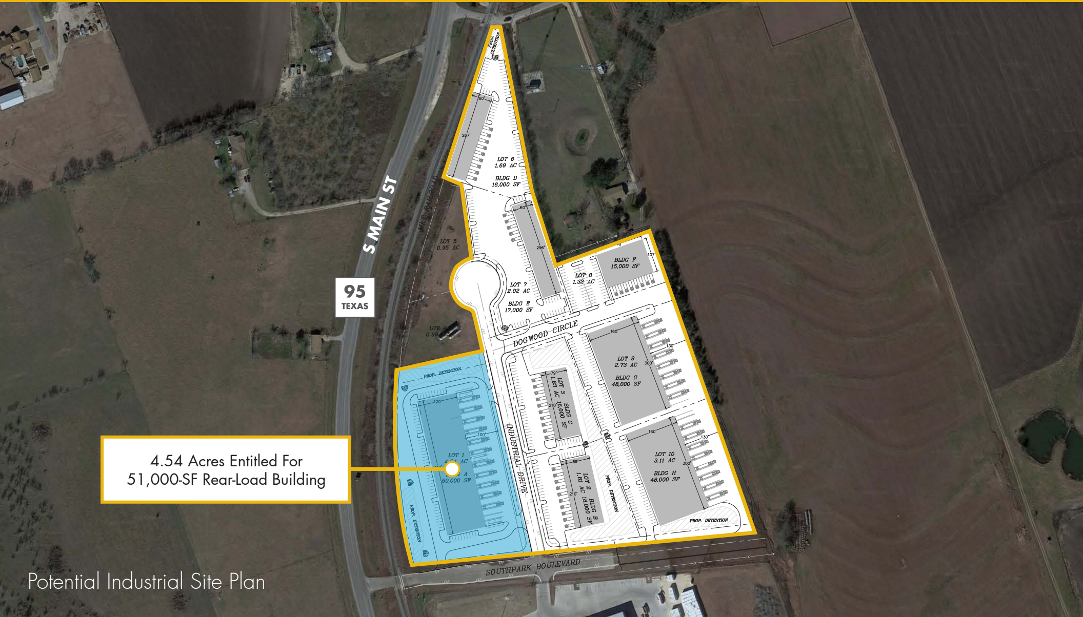
Potential Industrial Site Plan