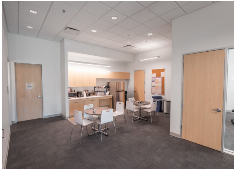
Clockwise from top left: Warehouse space, open office, conference room, break room